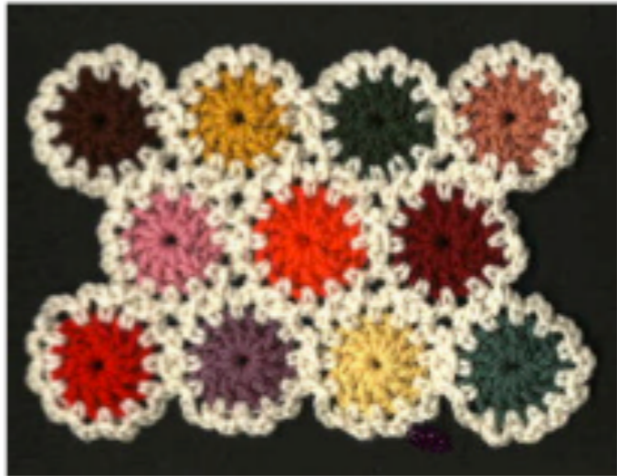
Scrap Afghan Section (Flat Braid Joining)