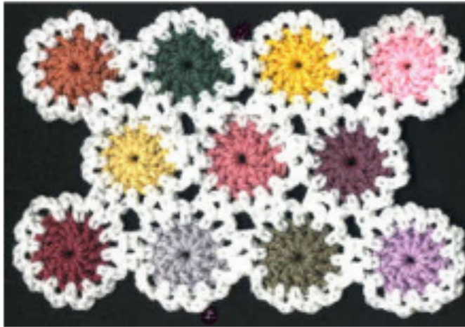
Scrap Afghan Section (Net Stitch Joining)