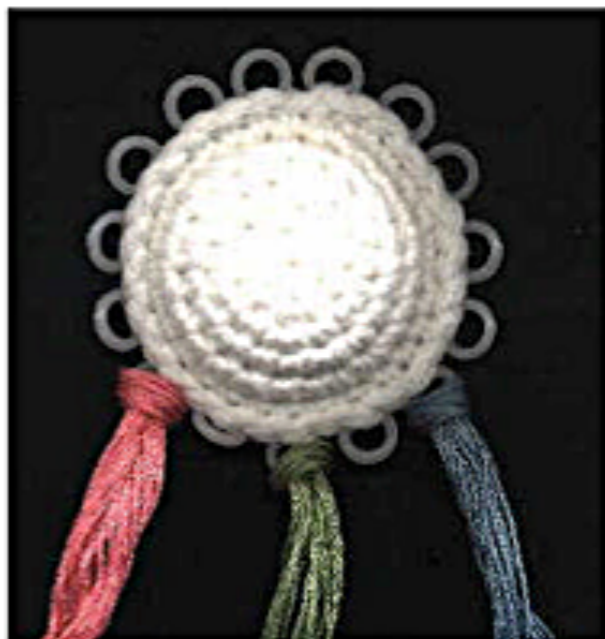
Floss holder with pincushion