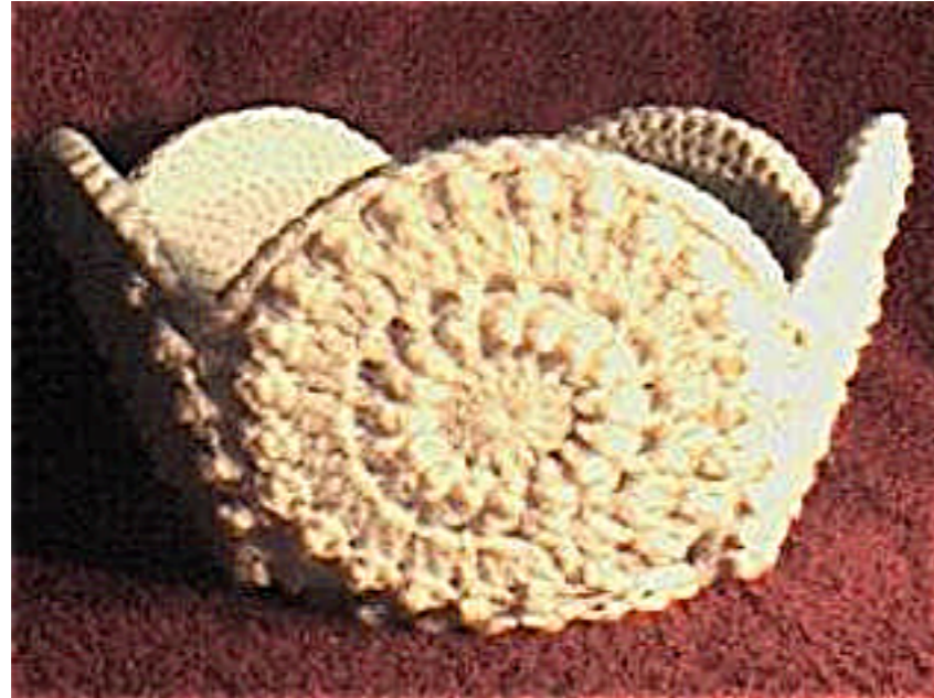
CD GIFT BASKET Designed by Priscilla Hewitt Copyright © 2001 Priscilla's Crochet